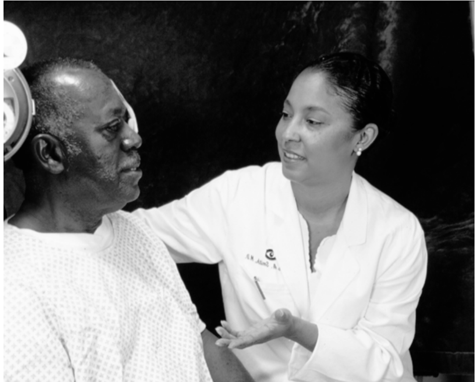
National Eye Institute, National Institutes of Health

“Access is the timely use of personal health services to achieve the best possible health outcomes.”