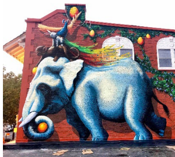
Four Harmonious Friends

We will know we are prioritizing the empowerment of our employees when we begin to see these outcomes: