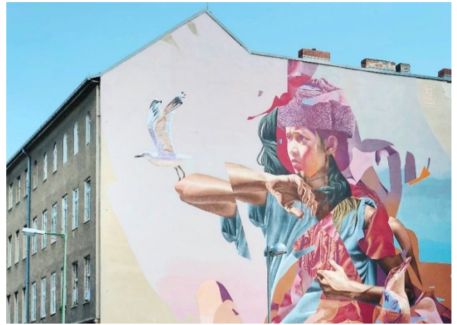
Catching Art

Our Department is made strong by the collective intelligence of our diverse teams. We aim to leave no stone unturned in our work to find the brightest talent and skills to join us in accomplishing our mission.